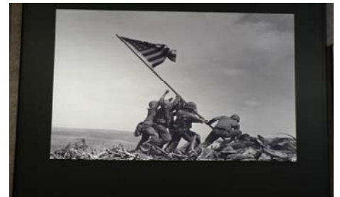
exhibit features 142 winning photographs, color and black white, representative of instantly recognizable historic moments from around the world, evoking a wide range of emotions in the visitor.

* "Capture The Moment: Pulitzer Prize Photography" now open through March 21, 2009. This is the largest and most comprehensive exhibition of Pulitzer Prize winning photographs ever shown in the United States. The